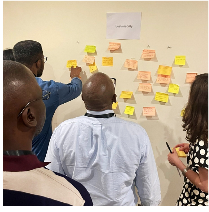
Attendees of the Global Goods Innovators Summit brainstorm discussion topics

Additionally, Digital Square updated maturity models for digital health tools to help identify areas of investment for global goods. The organisation revised its maturity model for software global goods and introduced a new model for content