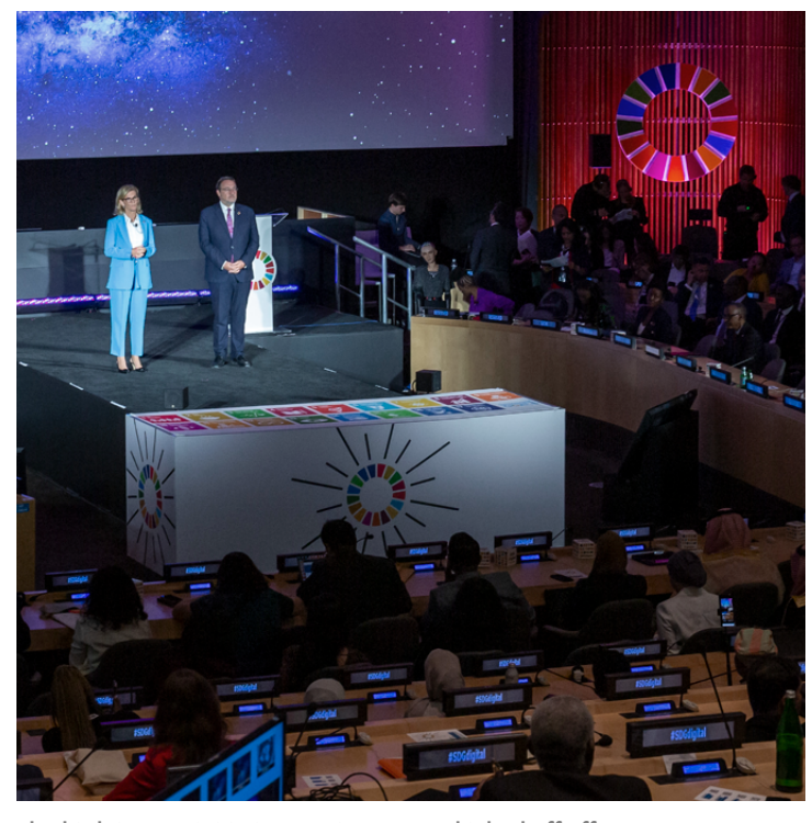
The high impact initiative session on DPI kicked off efforts to secure financing and technology for DPI design, development and implementation at scale, including through the use of DPGs

An automated fact-checking tool using AI and human fact checking to combat the spread of false narratives during