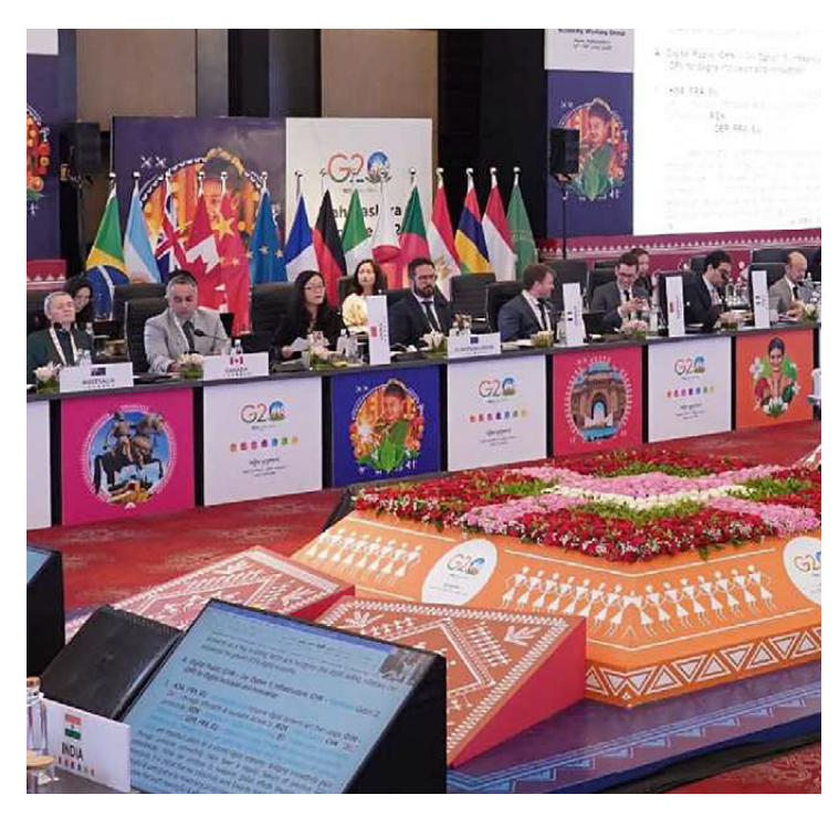
Global DPI Summit

While progressing in these initiatives, India encountered challenges related to the direct adoption of DPGs leading to high cloud hosting charges. This highlighted the importance of customisation before deploying DPGs in a production environment.