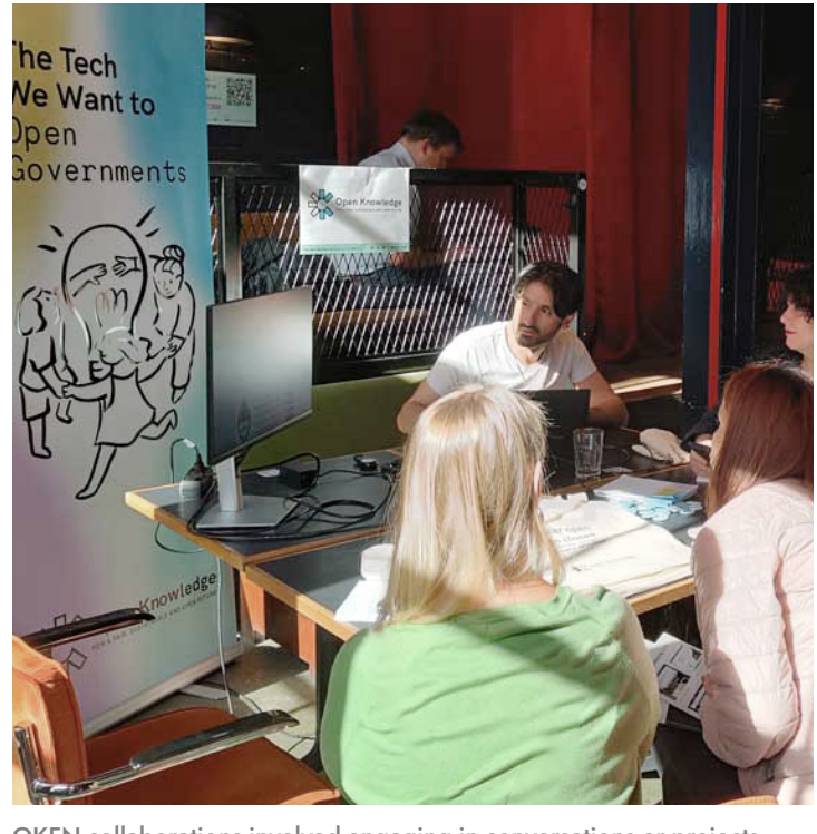
OKFN collaborations involved engaging in conversations or projects, including with other DPGA members

In 2023, OKFN worked alongside other DPGA members including UNDP, the Bill & Melinda Gates Foundation, IDB, and the Foundation for Public Code. These collaborations involved engaging in conversations or projects related to the DPI for electoral processes work with UNDP, providing technological services for the development of an internal data exchange portal (GDx) for Bill & Melinda Gates Foundation,