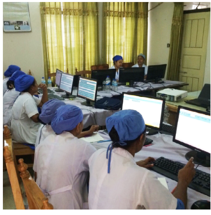
The Bangladesh Government has been an early adopter of Bahmni, implemented as a pilot in 2016 and rolled out to 50 facilities by 2018

As part of a pilot with the Government of Karnataka, Thoughtworks built an offline app called Bahmni outreach