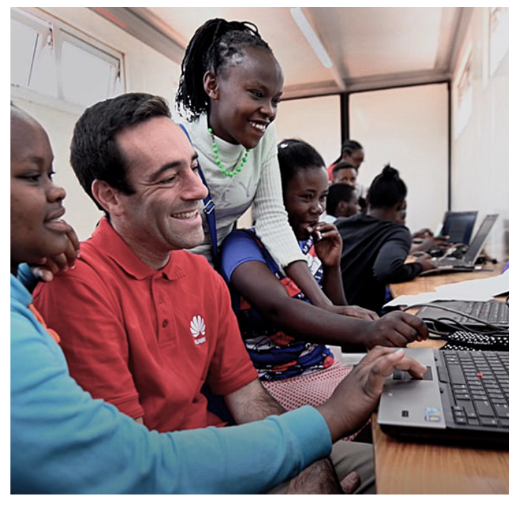
A converted shipping container on wheels, DigiTruck helps increase the use of electronic services

In collaboration with Huawei, the Ministry of ICT is providing digital skills training to citizens in the informal sector, including market vendors and bike riders. This training enables them to effectively consume digital services, including DPGs. There has been an observed increase in the use of electronic