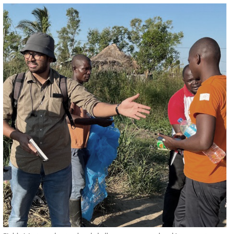
Field visits to understand real challenges on ground and incorporate user centricity in program and product design

2024 will also provide eGov Foundation the opportunity to focus on co-creating standards-based, user-friendly, and interoperable DPI. eGov Foundation plans to develop tools such as sandboxes and workbenches, aimed at simplifying the process of building on and deploying DIGIT DPG across varying technical skill levels. To ensure sustainability, eGov Foundation aims to build a coalition of local partners and establish regional