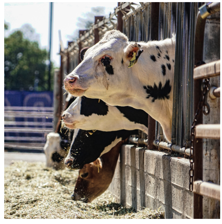
The Agrokomek app, provides practical and localised information to rural communities in Kazakstan

The FAO Digital Services Portfolio DPG will benefit from a new product vision and roll out to additional countries such as Kyrgyzstan, Haiti, and Dominican Republic. The Agroinformatics platform will be better equipped to produce advanced information and data, including food security