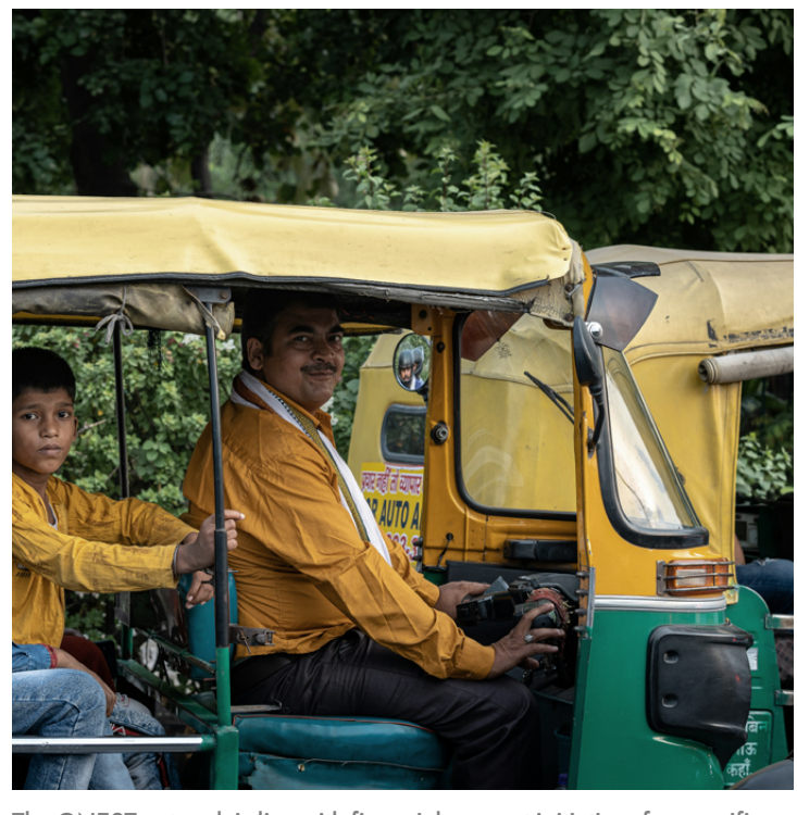
The ONEST network is live with financial support initiatives for specific groups, such as children of auto-drivers and delivery agents

Next year, EkStep Foundation will continue to promote DPI, facilitating the creation of a DPG tech enabler ecosystem, onboarding Al advances to Sunbird DPG, and scaling ONEST. They will also scale key initiatives like ONEST and Bachpan Manao Badhte Jao, accelerating the adoption of DPGs for verifiable digital credentials, and enhance Al-based DPGs for removing language and literacy barriers.