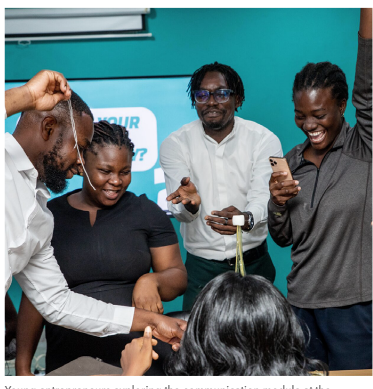
Young entrepreneurs exploring the communication module at the UNICEF StartUp Lab in Accra

In order to support innovators across the world in designing, continuously evolving, and maintaining DPGs that lead to impact at scale, including for children, UNICEF developed the Djenga Software Maturity Assessment. This global assessment framework analyses DPG maturity, supporting product owners in developing mature and sustainable DPGs, and implementers in identifying mature DPGs that are ready for deployment at scale. The self-assessment tool for product owners aims